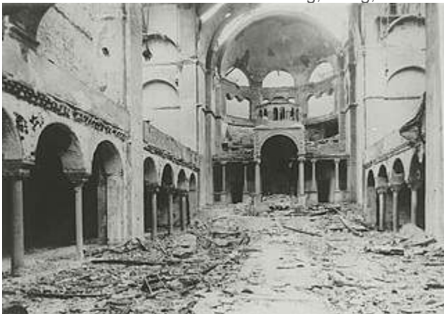
Synagogue in Berlin

Notes: The Wizard of Oz premiered on August 10, 1939, a few months after Kristallnacht destroyed 267 synagogues, Jewish homes, schools, 7000 businesses, and sent 30,000 Jews to concentration camps, killing nearly 100 people that night. Passover remembers the Jews' suffering while enslaved in Egypt and celebrates the freedom their descendants possess in the present day. Arlen and Harburg recognized that their people's suffering was not in the past, rather something they persistently experienced before and after the Holocaust. These Jewish composers created "Somewhere Over the Rainbow" "Ding, Dong, the Witch is Dead" to illustrate a future society worth working for.